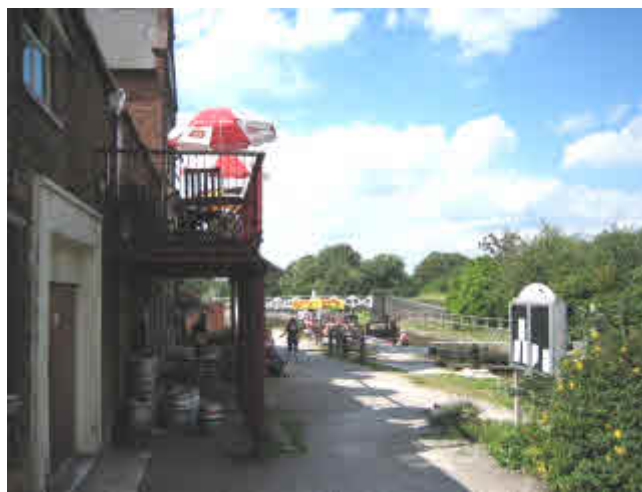
The Big Lock – potential waiting to be unlocked

Externally it's a rambling red brick building dating from the Victorian era. The surprisingly spacious interior comprises a main bar area in the centre, with a games room and snug leading off it and a long, airy dining area running along the side of the pub nearest the canal, opening out on to a terrace above the towpath. It was pleasant enough but perhaps needed a lick of paint here and there, something the new owners will no doubt attend to. It also suffered from the common problem of a group of regulars clustering around the bar and making access to the counter difficult.