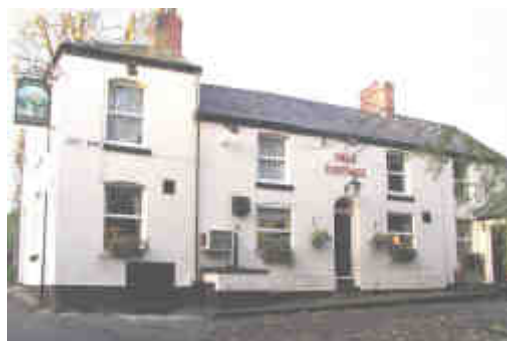
The award-winning Vale Cottage

The Wagon and Horses was the biggest pub of the evening, and both rooms were also the busiest in the tradition of Holt's houses. The mild was the proffered choice of most of the party, but unfortunately those with the most bar 'presence' were rewarded with a lukewarm offering. In comparison the bitter was served at a far more acceptable temperature. The warm halves of mild that had sat in the pipes for too long were exchanged without query. The mild shaded the good bitter, and was rated excellent.