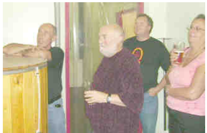
Local CAMRA members enjoying the Greenfield tour