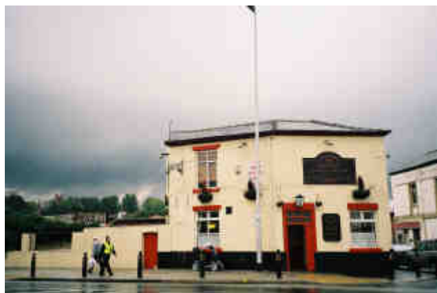
Storm clouds gather over the Railway

Dave Porter has announced that the Railway on Portwood is likely to close early next year. See Stockport Supping on page 9 for the full story.