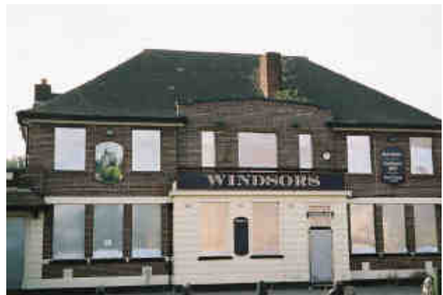
Windsors in Edgeley, Stockport – for sale but no buyers

For everyone’s sake our message to these companies echoes the MEN – Get it Sorted – and soon!