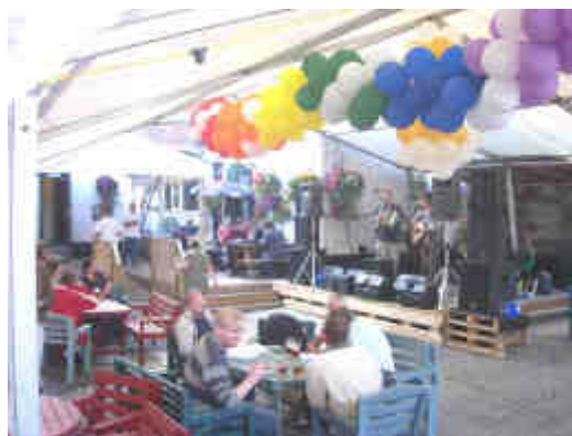
Festival Fun at the Barrels

but this outgrew the premises and moved up the road to Stoke Lacy in 2002.