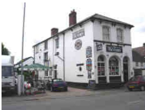
The Victory – home of Spinning Dog Brewery

Hereford is not a real ale Mecca, having only three Good Beer Guide pubs, but one of them, the Barrels was holding its charity Beer Festival. The pub lies some 10 minutes walk from the station but a couple of minutes further up the road is another beery attraction - a Good Beer Guide-listed pub called the Victory. Not only does this pub have a bar made to look like a galleon, but it is also the home of the award winning Spinning Dog Brewery.